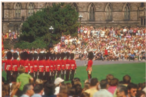
The Changing of the Guard is a ceremony that takes place at the Parliament Buildings in Ottawa.