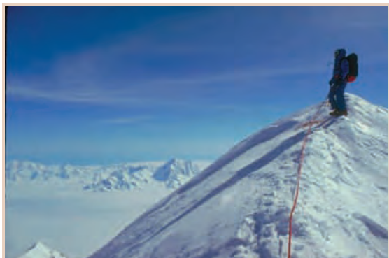
Pictured is Mount Logan in the Yukon Territory. This is Canada's highest mountain.