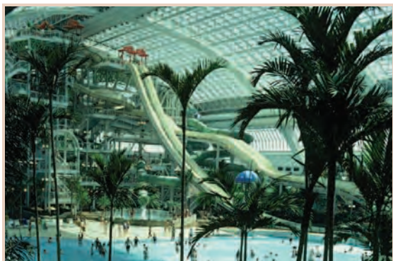
The West Edmonton Mall, pictured here, is one of the largest shopping malls in the world.