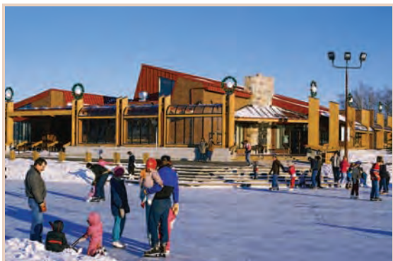
Ice skating is a popular winter sport in Canada. Here are skaters in Muskoseepi Park in Grande Prairie, Alberta.