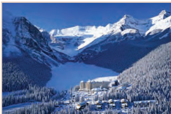
The hotel Château Lake Louise in Alberta in winter.